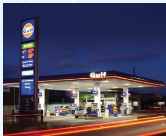
Oil & Specialty Chemicals