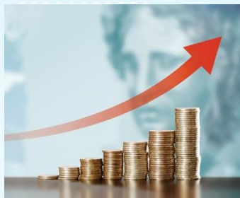
Banking & Finance