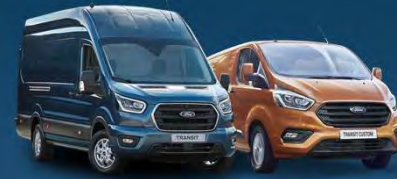
Transit and Custom