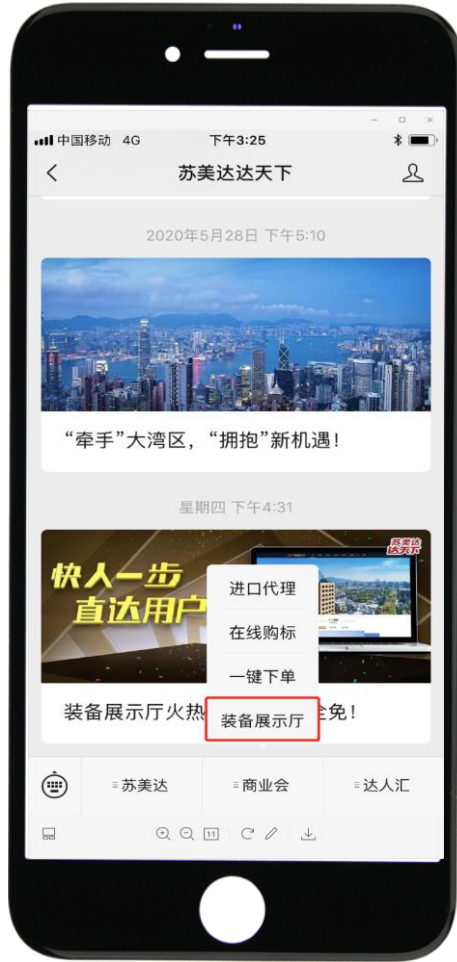
Front Page of SUMEC Public WeChat Account

Our Online Product Exhibit Hall which has near 100,000 end-users, is a free platform for exporters to showcase their market competency which ultimately help the buyer to identify and match with the optimal exporter in their requests