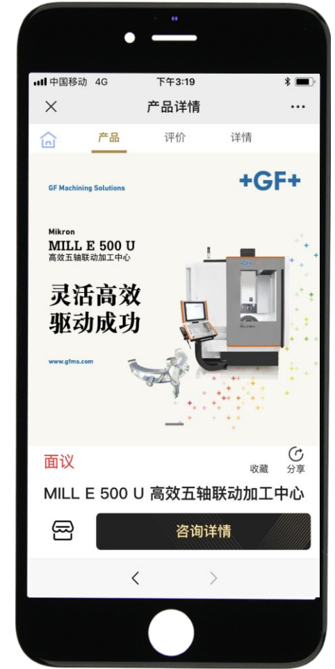
Selected Machinery Introduction & Promotion