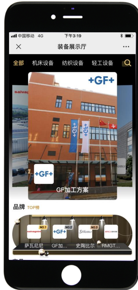
Front Page of Exhibition Hall