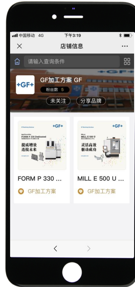
Home Page of Exporter/ Supplier